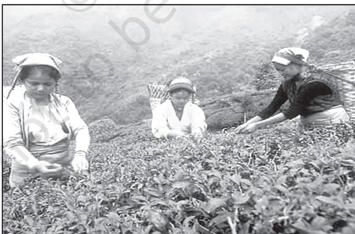
Tea pickers in Assam

Other changes have also redefined the nature of sociology and social anthropology. Modernity as we saw led to a process whereby the smallest village was impacted by global processes. The most obvious example is colonialism. The most remote village of India under British colonialism saw its land laws and administration change, its revenue extraction alter, its manufacturing industries collapse.