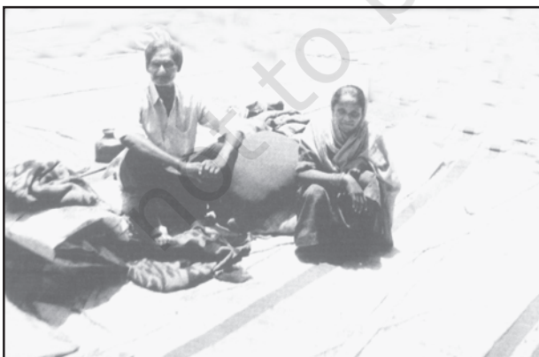
A homeless couple

The facts of contemporary history are also facts about the success and the failure of individual men and women. When a society is industrialised, a peasant becomes a worker; a feudal lord is liquidated or becomes a businessman. When classes rise or fall, a man is employed or unemployed; when the rate of investment goes up or down, a man takes new heart or goes broke. When wars happen, an insurance salesman becomes a rocket launcher; a store clerk, a radar man; a wife lives alone; a child grows up without a father. Neither the life of an individual nor the history of a society can be understood without understanding both... (Mills 1959).